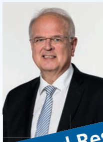
Dr. Reinhard Resch Mayor of the City of Krems

The cultural offerings and the quality of life are also valued by the more than 2,000 companies and are an important locational advantage for Krems.”